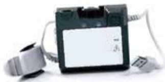
SpO 2 Kit

Adopts a series of complete accessories to meet different usage scenarios and needs: