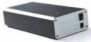
Power Bank (D1402)