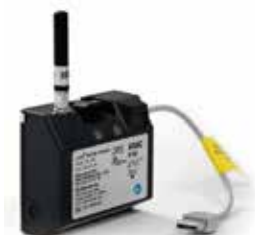
GPRS / Wi-Fi Kit